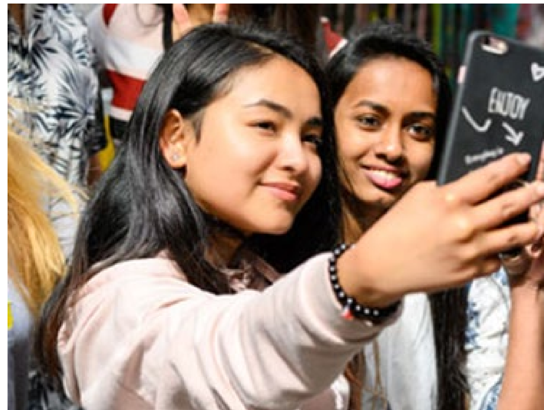
Counselling & Wellbeing Services