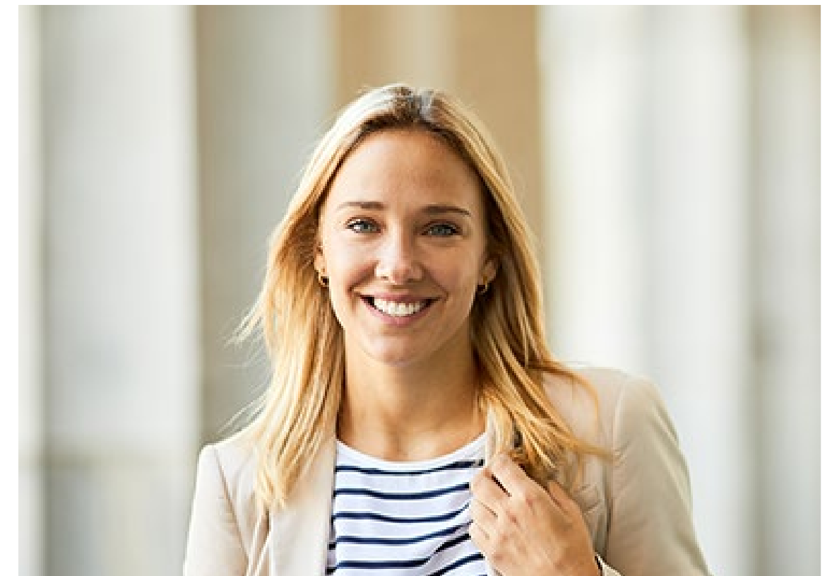
Career Development Centre