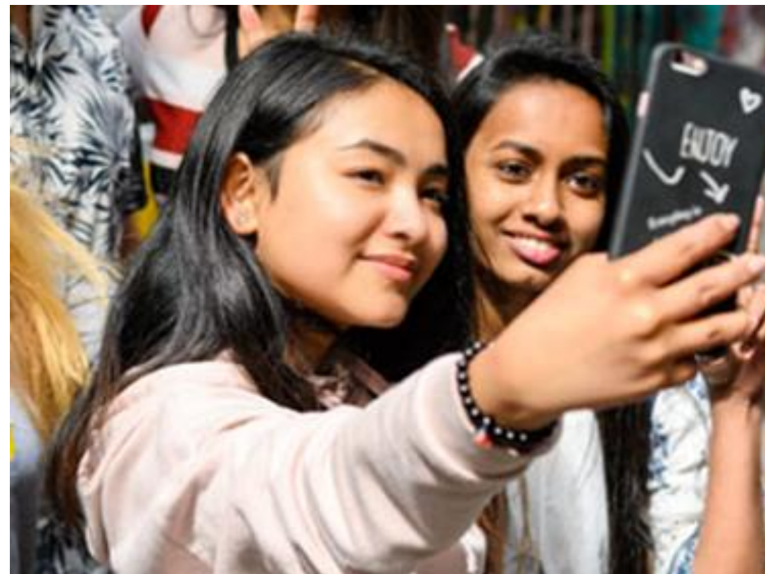
Health & Wellbeing