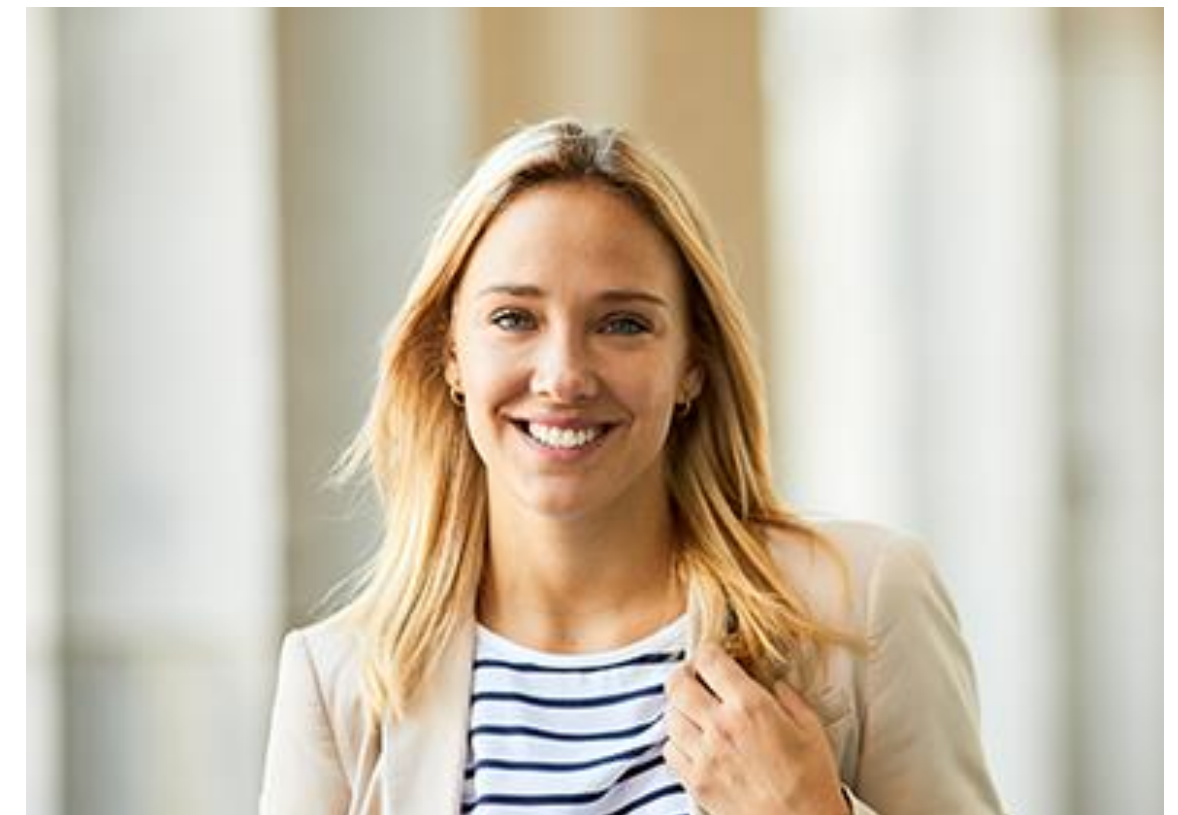
Career Development Centre