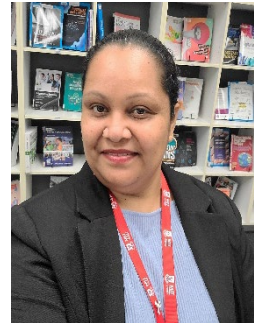
Mere Tanoa Vada Library (Level 3)

Ph: (02) 8267 1411 E: library.syd@mit.edu.au