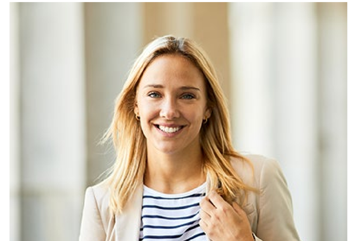
Career Development Centre